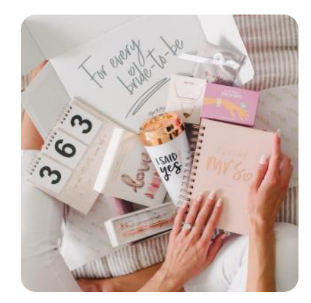
CELEBRATE Receive exclusive bridal goodies, tips and inspiration $100+ value for only $35 per box.