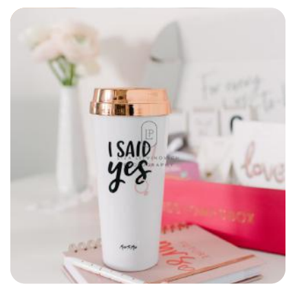
WE CURATE Every box has a unique theme aligned to a certain stage of the wedding planning process.

Whether your wedding is in 2021, 2022 or even 2023, we have a perfect plan right for you.